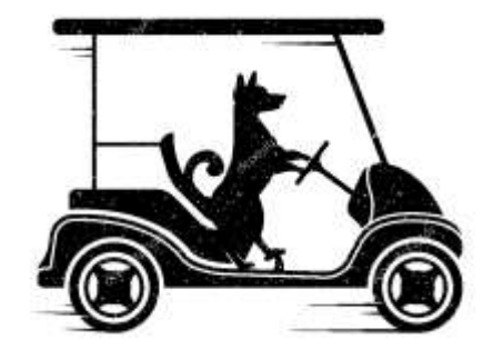
Golf Carts are allowed. Please drive slowly!!