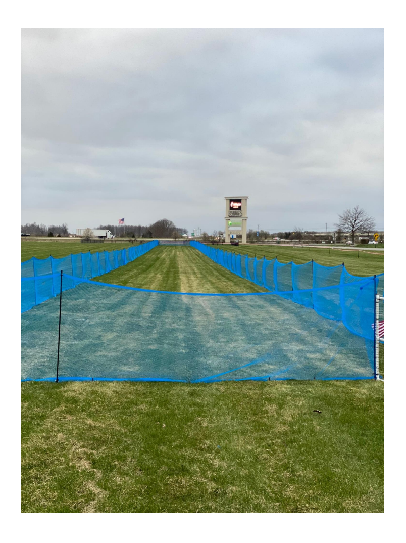
Fast CAT field at the Roberts Centre

ENTRANTS & SPECTATORS TO THESE EVENTS ENTER & ATTEND ENTIRELY AT THEIR OWN RISK.