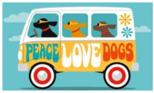
RV Camping on site

See next page for RV Reservation Information