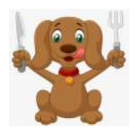
BREAKFAST / LUNCH

http://www.co.escambia.fl.us/departments/parks There are 34 RV sites with water & sewer, dump station with wash down and 50/30/110 individual electrical service. $25.00 per day (includes water, electrical hookups and use of shower/restroom facilities). Please send check w/reservation with Fees payable to FFDTC to: Linda Mills, 7757 Folkstone Dr., Pensacola, FL 32514, (c) 850 291-0973, sheltiepap@gmail.com