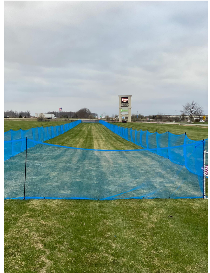
Fast CAT field at the Roberts Centre

ENTRANTS & SPECTATORS TO THESE EVENTS ENTER & ATTEND ENTIRELY AT THEIR OWN RISK.