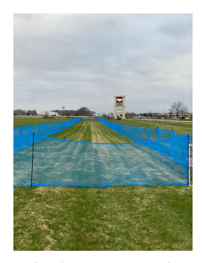
Fast CAT field at the Roberts Centre Roberts Centre Map

ENTRANTS & SPECTATORS TO THESE EVENTS ENTER & ATTEND ENTIRELY AT THEIR OWN RISK.