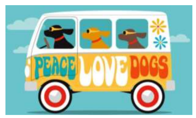
RV Camping on site

A very limited (4 spots) amount of space is available for RV's at the trial site. There are no hook ups or water available. These spots will be allocated on a first come first serve basis so please email the trial secretary to reserve a spot as soon as possible. speeddogcoursing@gmail.com