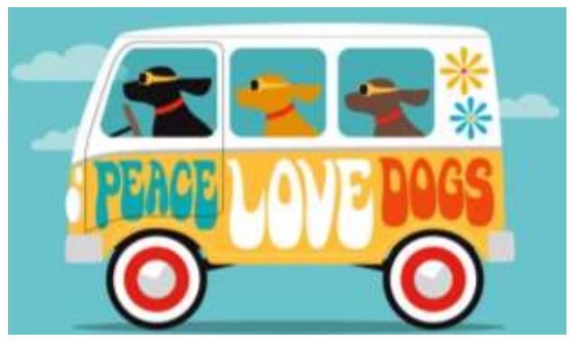
RV Camping on site

No overnight RV parking at Providence Park. There is a KOA located at 1240 General Booth Blvd Virginia Beach, VA 23451