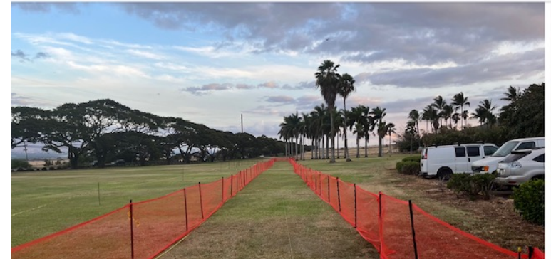
Google Maps Maui Tropical Plantation

Field Conditions. The field is fairly level. The surface is grass that is mowed short. The track is approximately 460' long and is fully fenced with mesh fencing. Mounted entry and exit gates are also part of the track. Handlers must be at the Catch area BEFORE their dog can be brought to the line.