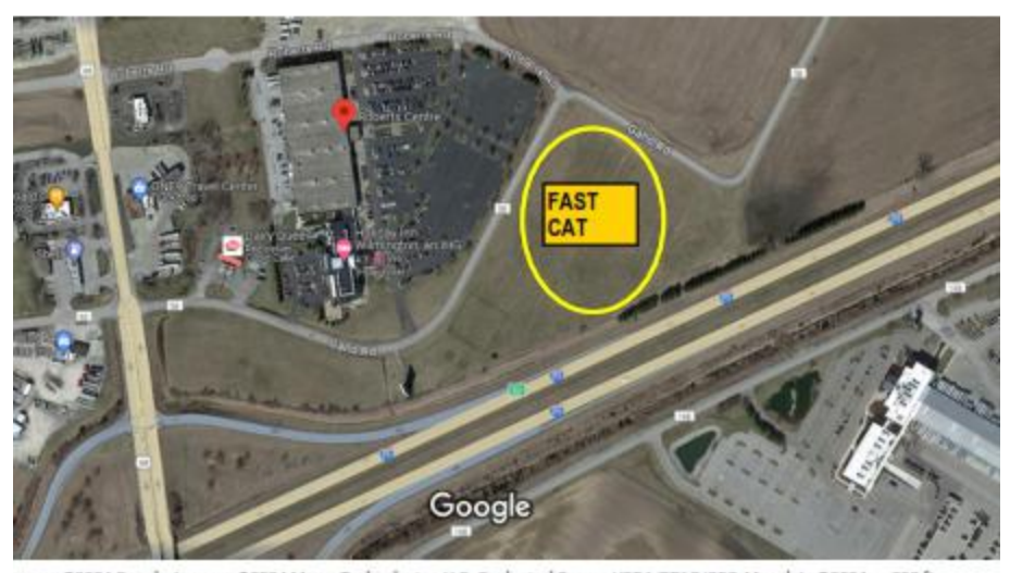
agery ©2024 Google, Imagery ©2024 Maxar Technologies, U.S. Geological Survey, USDA/FPAC/GEO, Map data ©2024 2